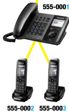
3 Users: 3 DID